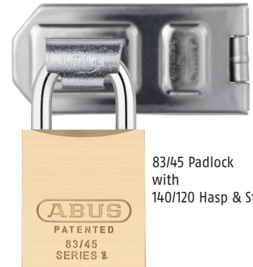
83/45 Padlock with 140/120 Hasp & Staple