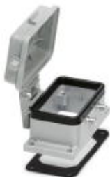
HEAVYCON B10 panel mounting base, for double locking latch, height: 29 mm, with plastic cover, with flat gasket

Please be informed that the data shown in this PDF Document is generated from our Online Catalog. Please find the complete data in the user's documentation. Our General Terms of Use for Downloads are valid ( http://download.phoenixcontact.com )