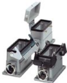
Box mounting base, with single locking latch, height 67 mm, with screw connection, 1x Pg21

Please be informed that the data shown in this PDF Document is generated from our Online Catalog. Please find the complete data in the user's documentation. Our General Terms of Use for Downloads are valid ( http://phoenixcontact.com/download )