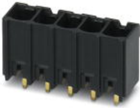
MSTB contact insert, for PCB assembly, 24 V, 5-pos., with straight solder pins, RAL 9005 (black), for panel mounting frame VS-PPC-F2-MSTB-...-1R-P

Please be informed that the data shown in this PDF Document is generated from our Online Catalog. Please find the complete data in the user's documentation. Our General Terms of Use for Downloads are valid ( http://download.phoenixcontact.com )