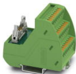
VARIOFACE sensor module, for connecting 8 pnp sensors, with LED

Please be informed that the data shown in this PDF Document is generated from our Online Catalog. Please find the complete data in the user's documentation. Our General Terms of Use for Downloads are valid ( http://phoenixcontact.com/download )