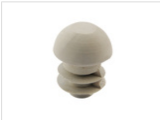
Rubber feet, plug-in

For M/T 210-215, M/T 217, M/T 220-227, M/T 231