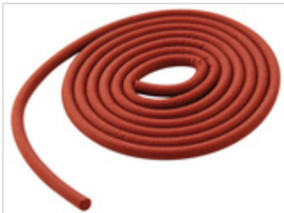
Silicone seal for lid