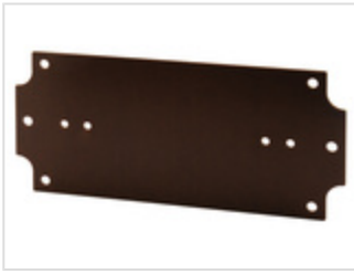
Mounting plates, laminated paper (Pertinax), galvanised steel for version 260