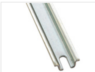
DIN rails DIN EN 60715 TH 15