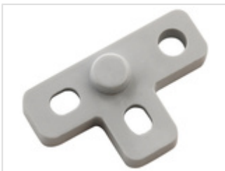
Wall brackets on rear, screw-on, polycarbonate