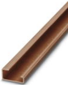
G-profile DIN rail, material: Copper, unperforated, height 15 mm, width 32 mm, length 2 m

Please be informed that the data shown in this PDF Document is generated from our Online Catalog. Please find the complete data in the user's documentation. Our General Terms of Use for Downloads are valid ( http://download.phoenixcontact.com )