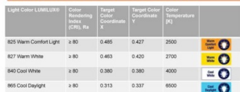
Light colors, color rendering properties and Light Color Coordinates for OSRAM DULUX® - lamps with integrated control gear

1 Datasheet | ORG CODE | Website Titel/Versionierung | TMM/LLJ