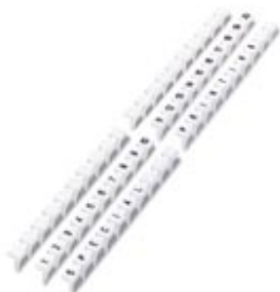
Marker pin Zack strip, Sheet, white, unlabeled, can be labeled with: Plotter, Mounting type: Plug in, Lettering field: 1.8 x 1 mm

Please be informed that the data shown in this PDF Document is generated from our Online Catalog. Please find the complete data in the user's documentation. Our General Terms of Use for Downloads are valid ( http://phoenixcontact.com/download )