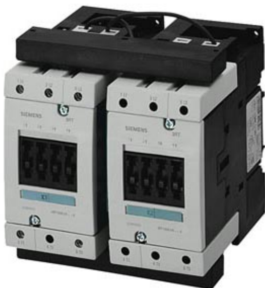
REVERSING CONTACTOR COMBINATION AC-3 45 KW/400V, SIZE S3 AC 110 V 50 HZ/120 V 60HZ