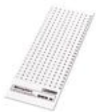
Marker cards, Card, white, Unlabeled, Can be labeled with: Plotter, Mounting type: Snap into tall marker groove, Snap into flat marker groove, For terminal block width: 6.2 mm, Lettering field: 6 x 6.1 mm

Marker cards - SBS 6:UNBEDRUCKT - 1007222