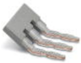
Insertion bridge, Number of positions: 3, Color: gray