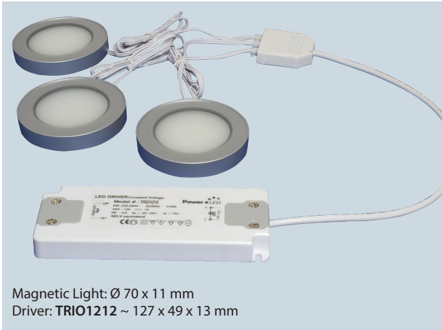
Magnetic Light: Ø 70 x 11 mm Driver: TRIO1212 ~ 127 x 49 x 13 mm