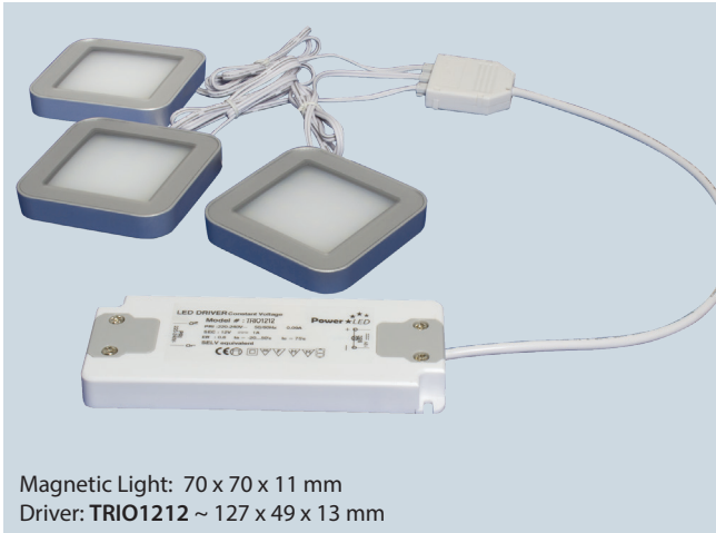
Magnetic Light: 70 x 70 x 11 mm Driver: TRIO1212 ~ 127 x 49 x 13 mm