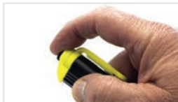
RUBBERISED MICRO SWITCH