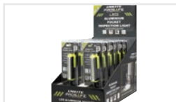
SUPPLIED READY MERCHANDISED