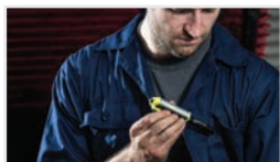
CONVENIENT POCKET SIZE