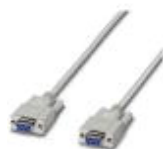
RS-232 cable, 9-pos. D-SUB socket on 9-pos. D-SUB socket, 9-wire, 1:1

Data cable - PSM-KA9SUB9/BB/2METER - 2799474