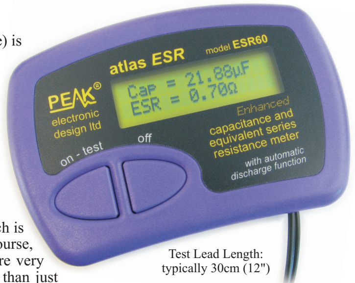
Test Lead Length: typically 30cm (12")

Traditionally, ESR can be a tricky thing to measure, which is a shame, it's a very useful diagnostic parameter. Of course, ESR meters are available from various sources, some are very famous in the repair sector, but the Atlas ESR is more than just another ESR meter. For a start, it's smart, both in looks and in brain. It can measure and compensate for the effects of measuring in-circuit, it also knows that you don't want to be hassled with capacitor polarity.