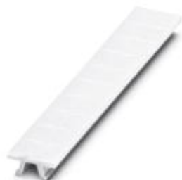
Zack marker strip, 10-section, horizontally labeled with the consecutive numbers: 181 ... 190, white, Width: 6 mm

Please be informed that the data shown in this PDF Document is generated from our Online Catalog. Please find the complete data in the user's documentation. Our General Terms of Use for Downloads are valid ( http://download.phoenixcontact.com )