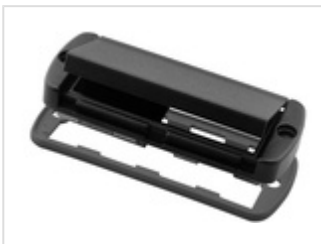
Mounting lid with hinged aluminium flap and compartment for 9V block battery