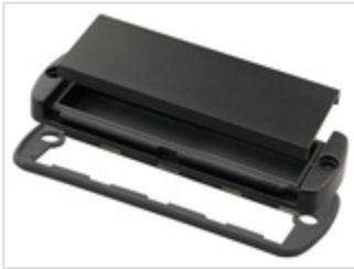
Mounting lid with removable aluminium cap