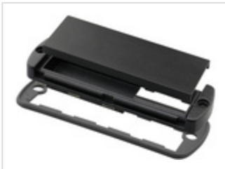
Mounting lid with removable aluminium cap and compartment for 9V block battery