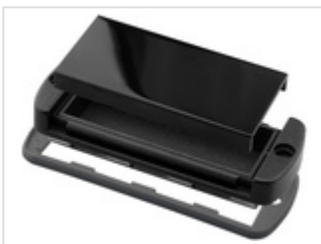
Mounting lid with infrared-permissive plastic cap