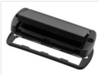
Mounting lid with hinged aluminium flap