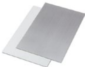
Engraving plate for outdoor use, material thickness: 0.8 mm, length: 300 mm, width: 280 mm, engraving plate

Please be informed that the data shown in this PDF Document is generated from our Online Catalog. Please find the complete data in the user's documentation. Our General Terms of Use for Downloads are valid ( http://phoenixcontact.com/download )