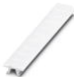
Zack marker strip, Strip, white, labeled, can be labeled with: Plotter, Printed horizontally: Identical numbers 1 or 2, etc. up to 100, Mounting type: Snap into tall marker groove, for terminal block width: 6.2 mm, Lettering field: 6.15 x 10.5 mm

Zack marker strip - ZB 6,LGS:GLEICHE ZAHLEN - 1051032