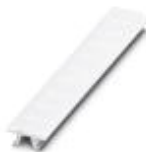
Zack marker strip, Strip, white, labeled, can be labeled with: Plotter, Printed horizontally: Consecutive numbers 1 - 10, 11 - 20, etc. up to 491 - 500, Mounting type: Snap into tall marker groove, for terminal block width: 6.2 mm, Lettering field: 6.15 x 10.5 mm

Zack marker strip - ZB 6,LGS:FORTL.ZAHLEN - 1051016