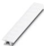
Zack marker strip, Strip, white, labeled, can be labeled with: Plotter, Printed vertically: Consecutive numbers 1 - 10, 11 - 20, etc. up to 491 - 500, Mounting type: Snap into tall marker groove, for terminal block width: 6.2 mm, Lettering field: 6.15 x 10.5 mm

Zack marker strip - ZB 6,QR:FORTL.ZAHLEN - 1051029