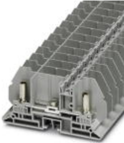
Test disconnect terminal block, cross section: 0.1 - 6 mm 2 , AWG: 26 - 8, width 13 mm, color: gray

Please be informed that the data shown in this PDF Document is generated from our Online Catalog. Please find the complete data in the user's documentation. Our General Terms of Use for Downloads are valid ( http://download.phoenixcontact.com )