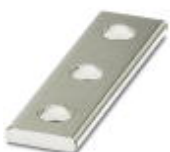
Connection element, Number of positions: 3, Color: silver

Connection element - HV-M10-VS 3 - 0711962