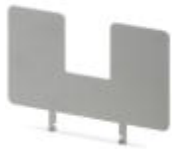
Separating plate, Color: gray