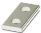
Connection element, Number of positions: 2, Color: silver

Connection element - HV-M10-VS 2 - 0711959