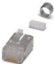
RJ45 pin insert, CAT5e, 8-pos., shielded, IDC connection method, for litz wires AWG 26 and solid wires AWG 26 ... 24

Please be informed that the data shown in this PDF Document is generated from our Online Catalog. Please find the complete data in the user's documentation. Our General Terms of Use for Downloads are valid ( http://phoenixcontact.com/download )