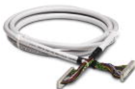
The illustration shows version FLK 40/EZ-DR/200/SLC

Round cable sets, with 40-pos. socket strips in fixed lengths (50 cm steps) to connect to 32-channel I/O cards of the SLC 500, length 1.5 m