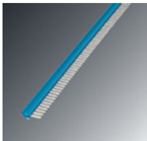
Plug-in bridge, Number of positions: 80, Color: blue

Please be informed that the data shown in this PDF Document is generated from our Online Catalog. Please find the complete data in the user's documentation. Our General Terms of Use for Downloads are valid ( http://download.phoenixcontact.com )