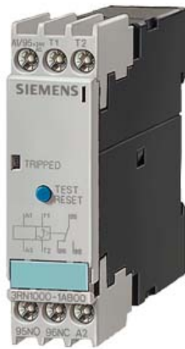
THERMISTOR MOTOR PROTECTION COMPACT EVALUATION UNIT AUTO, 1W, AC/DC 24V SCREW CONNECTION