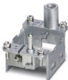
HEAVYCON hinged retaining frame, for HC-B 6 supporting base element, for 2 modules, labeling with lower case letters (a, b)

Please be informed that the data shown in this PDF Document is generated from our Online Catalog. Please find the complete data in the user's documentation. Our General Terms of Use for Downloads are valid ( http://download.phoenixcontact.com )