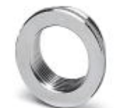
Reducing adapter, M40 on M32, incl. O-ring

Reducing adapter - REDUC-M-KV-M40/M32 - 1647640