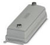
HEAVYCON ADVANCE IP65 protective cover B16, for panel mounting side, with screw locking, with retaining cord, diameter of retaining cord eyelet 3 mm

Protective covers - HC-B 16-TMS-SD-IP65 - 1690794