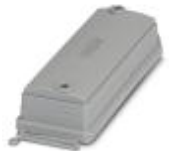
HEAVYCON ADVANCE IP50 protective cover B16, for panel mounting side, with clip locking, with retaining cord, diameter of retaining cord eyelet 3 mm

Protective covers - HC-B 16-TMS-SD-IP50 - 1690752