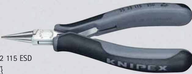
35 32 115 ESD