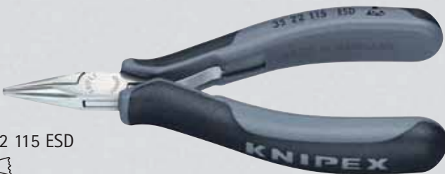
35 22 115 ESD