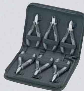
00 20 17