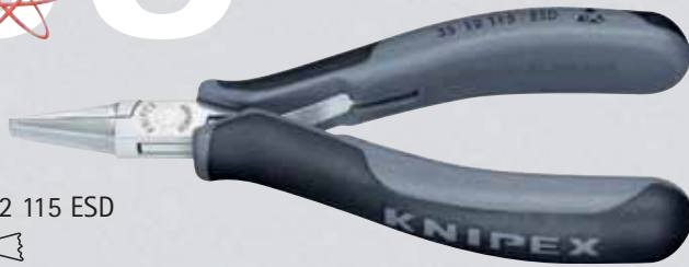
35 12 115 ESD