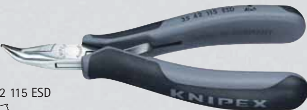
35 42 115 ESD