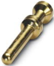
Turned 2.5 crimp contact, individual male contact, core diameter 2.5 mm 2 , gold-plated

Please be informed that the data shown in this PDF Document is generated from our Online Catalog. Please find the complete data in the user's documentation. Our General Terms of Use for Downloads are valid ( http://phoenixcontact.com/download )