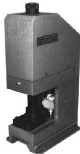
Pneumatic Bench Tool No. 312522-3 (Requires Die Set Holder No. 58449-1.)

Note: All part numbers are RoHS compliant.