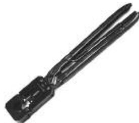
Hand Crimping Tool No. 543344-1 (Requires Die Sets, see table above.)