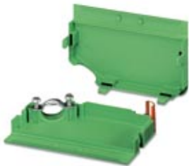
Cable housing, pitch: 0 mm, number of positions: 20, dimension a: 100 mm, color: green

Please be informed that the data shown in this PDF Document is generated from our Online Catalog. Please find the complete data in the user's documentation. Our General Terms of Use for Downloads are valid ( http://phoenixcontact.com/download )