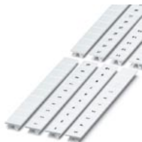
Zack marker strip, 10-section, vertically labeled with the consecutive numbers: 31 ... 40, white

Please be informed that the data shown in this PDF Document is generated from our Online Catalog. Please find the complete data in the user's documentation. Our General Terms of Use for Downloads are valid ( http://download.phoenixcontact.com )