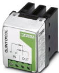
The figure shows the item QUINT-DIODE/40 2938963