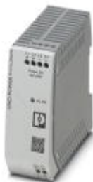
Primary-switched UNO POWER power supply for DIN rail mounting, input: 1-phase, output: 48 V DC/60 W

Please be informed that the data shown in this PDF Document is generated from our Online Catalog. Please find the complete data in the user's documentation. Our General Terms of Use for Downloads are valid ( http://phoenixcontact.com/download )