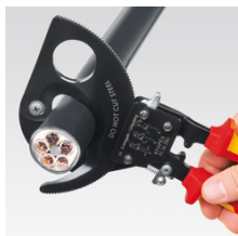
Ratchet principle and two-stage ratchet drive for easier cutting