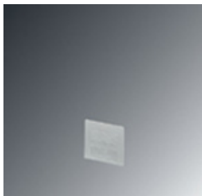
End cover, Length: 28 mm, Width: 1 mm, Height: 26.2 mm, Color: gray

Please be informed that the data shown in this PDF Document is generated from our Online Catalog. Please find the complete data in the user's documentation. Our General Terms of Use for Downloads are valid ( http://download.phoenixcontact.com )