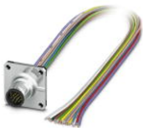
Sensor/actuator flush-type plug, 17-pos., M12, A-coded, front/square flange mounting, with 0.5 m TPE litz wire, 17 x 0.14 mm 2

Please be informed that the data shown in this PDF Document is generated from our Online Catalog. Please find the complete data in the user's documentation. Our General Terms of Use for Downloads are valid ( http://phoenixcontact.com/download )