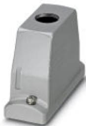
HEAVYCON ADVANCE EMC sleeve housing B24, with screw locking, height 100 mm, with 1xM40 support, and straight cable outlet

Please be informed that the data shown in this PDF Document is generated from our Online Catalog. Please find the complete data in the user's documentation. Our General Terms of Use for Downloads are valid ( http://phoenixcontact.com/download )