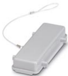
HEAVYCON protective cover, series B24, for supporting base element with double locking latch, with retaining cord, IP54, PA

Please be informed that the data shown in this PDF Document is generated from our Online Catalog. Please find the complete data in the user's documentation. Our General Terms of Use for Downloads are valid ( http://download.phoenixcontact.com )