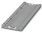
Magazine, for CMS-P1-PLOTTER, for accommodating UC-EMP..., UC-EMLP...