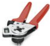
Crimping pliers with digital display

Crimping pliers with digital display - SF-Z0026 - 1607454