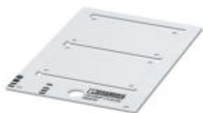
The figure shows the US-EMSP (75,6x54) version

Device marker, Card, yellow, unlabeled, can be labeled with: THERMOMARK CARD, Mounting type: Screws, rivets, Lettering field: 50 x 30 mm