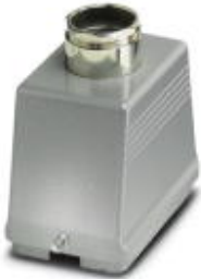
Sleeve housing, for single locking latch, height 96 mm, with screw connection, 1x Pg36, straight cable entry

Please be informed that the data shown in this PDF Document is generated from our Online Catalog. Please find the complete data in the user's documentation. Our General Terms of Use for Downloads are valid ( http://phoenixcontact.com/download )