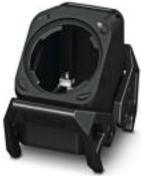
HEAVYCON EVO sleeve housing, plastic, with bayonet flange for EVO screw connection, B10, with double locking latch, height: 60.5 mm, without EVO screw connection

Please be informed that the data shown in this PDF Document is generated from our Online Catalog. Please find the complete data in the user's documentation. Our General Terms of Use for Downloads are valid ( http://phoenixcontact.com/download )