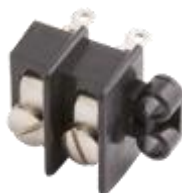
Drop-Through Solder Terminal 2 Way