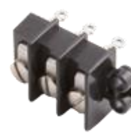
Drop-Through Solder Terminal 3 Way