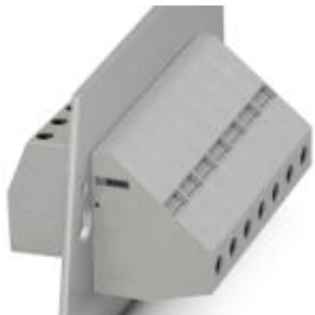
The illustration shows version HDFKV 25 in gray

Please be informed that the data shown in this PDF Document is generated from our Online Catalog. Please find the complete data in the user's documentation. Our General Terms of Use for Downloads are valid ( http://phoenixcontact.com/download )