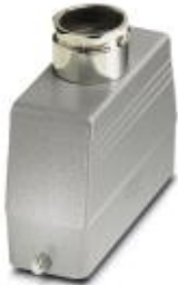
Sleeve housing, for single locking latch, height 76 mm, with screw connection, 1x Pg21, straight cable entry

Please be informed that the data shown in this PDF Document is generated from our Online Catalog. Please find the complete data in the user's documentation. Our General Terms of Use for Downloads are valid ( http://phoenixcontact.com/download )