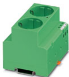
Rail-mountable double socket, with glow lamp, green housing

Please be informed that the data shown in this PDF Document is generated from our Online Catalog. Please find the complete data in the user's documentation. Our General Terms of Use for Downloads are valid ( http://download.phoenixcontact.com )