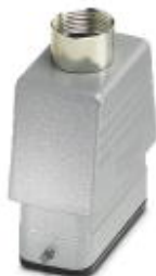
HEAVYCON sleeve housing D15, for single locking latch, height 66 mm, with support 1x M20, straight conductor exit

Please be informed that the data shown in this PDF Document is generated from our Online Catalog. Please find the complete data in the user's documentation. Our General Terms of Use for Downloads are valid ( http://download.phoenixcontact.com )