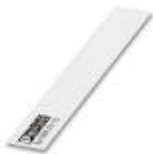
Marker for terminal blocks, Card, white, unlabeled, can be labeled with: CMS-P1-PLOTTER, perforated, mounting type: snap into tall marker groove, snap into flat marker groove, for terminal block width: 7.5 mm, lettering field size: 15 x 7.5 mm

Marker for terminal blocks - SBS 2,5/7,5 - 1007604